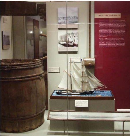
"Landscape of Change," the inaugural exhibit of the Fairfield Historical Society's newly opened Fairfield Museum and History Center, was one of 73 projects funded through the Cultural Heritage Development Fund in fiscal year 2007. The CHDF provided $102,750 in planning and implementation support for the exhibit.

Please see the complete list of grants at right.