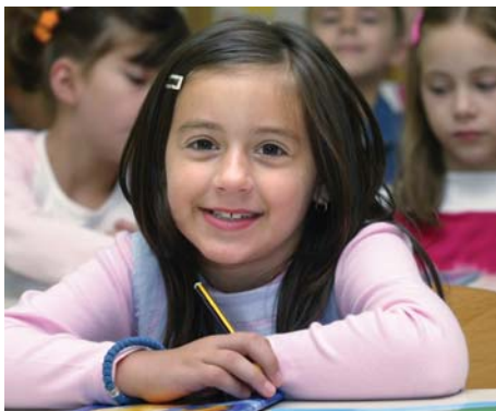
School children throughout the state benefit from projects funded through the Council's Humanities in the Schools granting program, which bring museum education resources into the classroom.

Please see the complete list of grants at right.