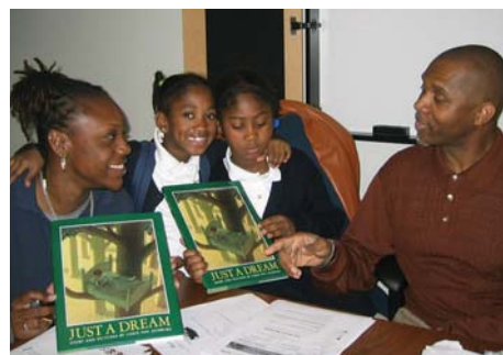
The Asylum Hill Boys and Girls Club was one of eight Hartford schools and community centers to host Book Voyagers during the fiscal year.

Please see page 11 for a complete list of programs.