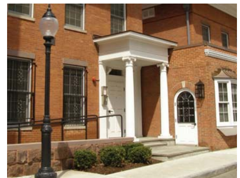
Heritage Preservation Technical Assistance grants help communities preserve their historic character in the face of mounting development pressures.

Please see page 8 for a complete list of grants.