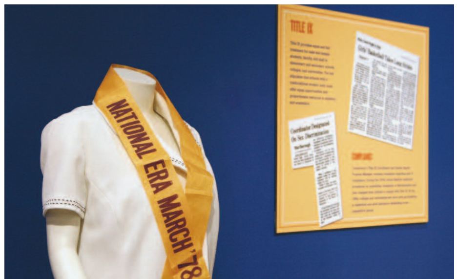
She Shoots...She Scores! The History of Women's Basketball in Connecticut.

$3,000, The Keepers of History: Scrapbooks and Photo Albums