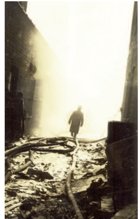
Greenwich Avenue Fire, 1936.

Hazardville Institute Conservancy (Enfield) $5,000, Hazardville Institute